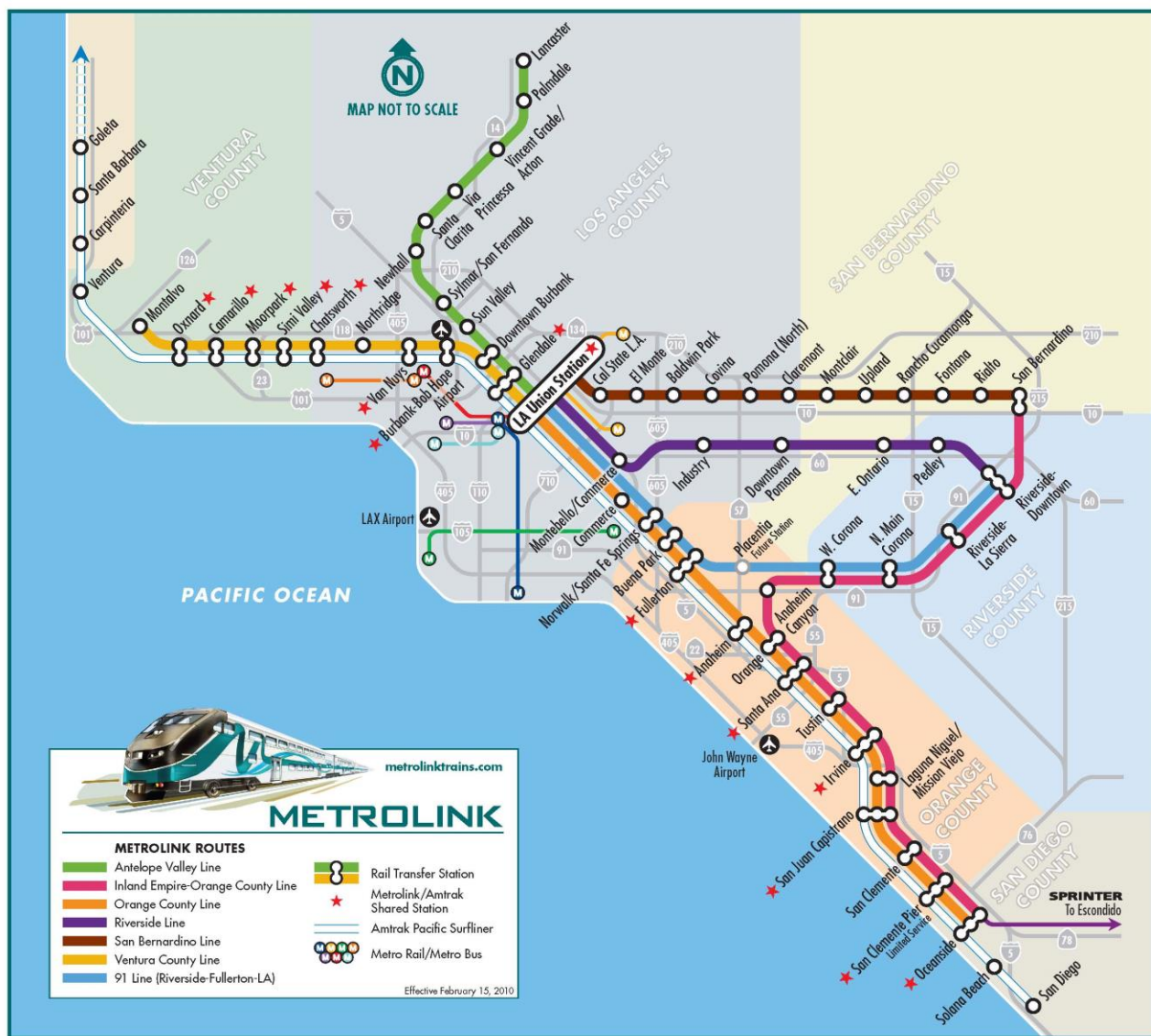
Metrolink System Map Figure 1